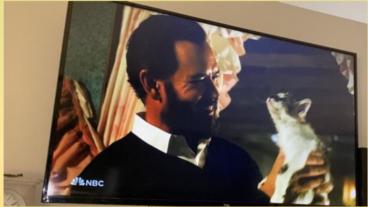
Mark-Paul Gosselaar as Sir (yes, this is the actor who played Zach Morris on "Saved by the Bell")