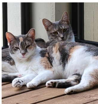
Maddie & Violet